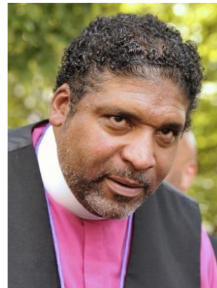
Rev. Dr. William Barber II

It came time for the assembly to vote on the nominee. All the speaking time had been taken up at the microphones prior to the call for the vote. But we could see onscreen standing next in line at the microphone the presence of our most articulate